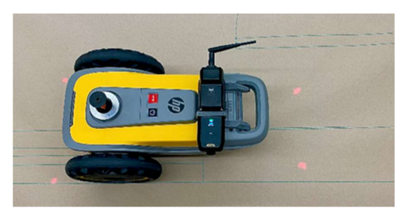
Figure 3. HPSitePrint Safety Sensors

Quality: Lastly, we evaluated the quality of the robot's print. We overlayed two layout prints using the