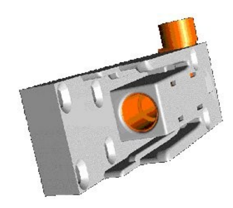
Figure 3. Services connector prototype

[5] Balaguer C. et al , FutureHome: An Integrated Construction Automation Approach, IEEE Robotics & Automation, Vol.9, No.1, Mar 2002, p. 55. [6] Murray N. et al , A Virtual Environment for Building Construction, 17th ISARC, Taiwan, Sep 2000, p. 1137.