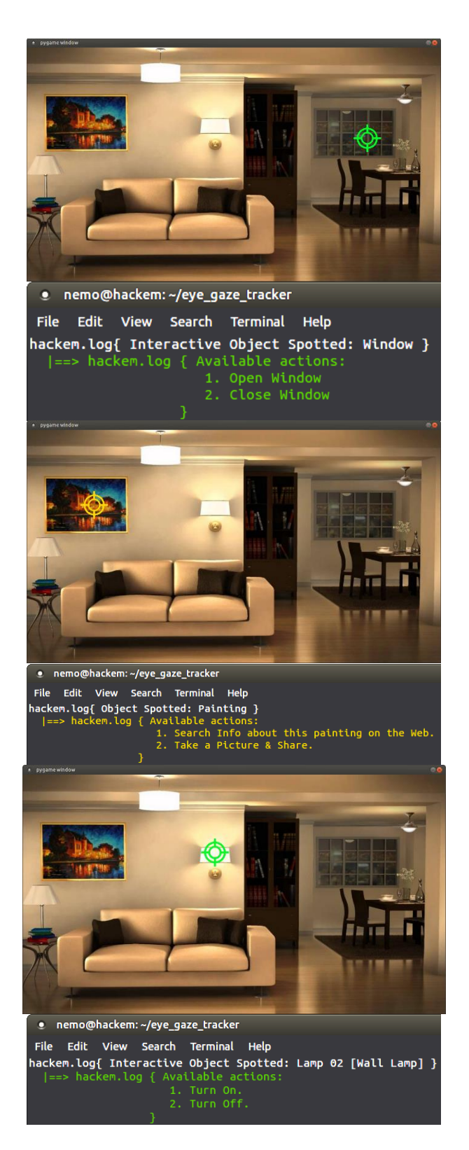
Figure 4. Top-to-Bottom: Pupil on object Window (green target/text); Wall-Art (yellow target/text); and Wall-Light (green target/text).

In the present setup, only three types of responses / options have been considered: (1) actuatable object (green eye-target); (2) static object (red eye-target); and (3) static object associated with non-physical actions (yellow eye-target). However, other possible responses / options may be envisioned for subsequent iterations of this feature of the mechanism.