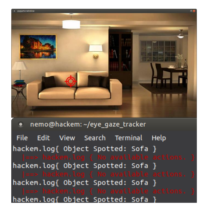
Figure 3. Pupil detected on object Sofa , with no available actuations.

With respect to the object actuation feature (see Section 3.1) of the present mechanism, three volunteers (with varying ages) (see Acknowledgements ) in addition to the authors tested its functionality and performance via the following five steps: