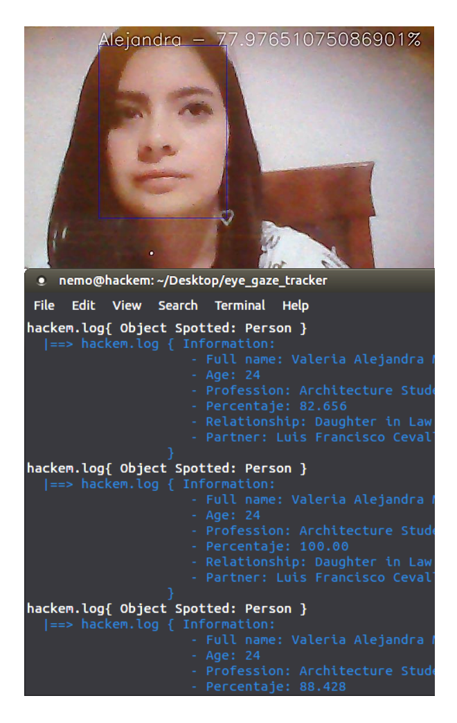
Figure 5. Recognition of a familiar face and corresponding output of associated information pertaining to the identified person.

With respect to the human identity recognition feature (see Section 3.2) of the present mechanism, a database of recognizable faces was first established, followed by a sequence of trials by the same three volunteers and the authors to gauge the feature's human identity recognition capabilities. The feature performed as expected, where the prediction accuracy probabilities were consistently above 70%.