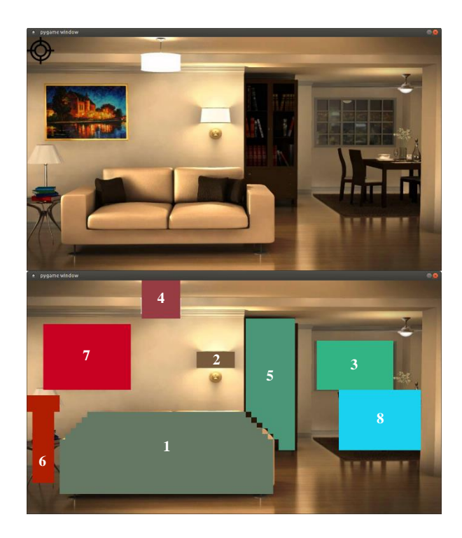
Figure 2. Top: Captured-gaze of generic sample built-environment. Bottom: Object-boundaries overlaid on top of objects represented. Both generated with PyGame.

In this implementation, the engagement with actuable objects and systems (e.g., doors, windows, lights, etc.) is limited to their generic virtual representation (see Figure 2, Top). That is, while previous implementations have required the building of physical representations in real-scale, the present development only requires confirmation of engagement at a software level to ascertain its functionality. Accordingly, a black-box approach is adopted with respect to the other subsystems of the inherited WSAN. In this manner, the present mechanism is said to actuate a window, a door; or to turn on/off a light, etc., if the user is detected to be engaging with a given object / system and the eye- and gaze-tracking mechanism does indeed respond by sending a signal to actuate or to turn on/off.