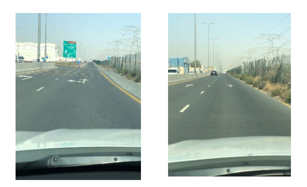
Figure 4. Annotated template