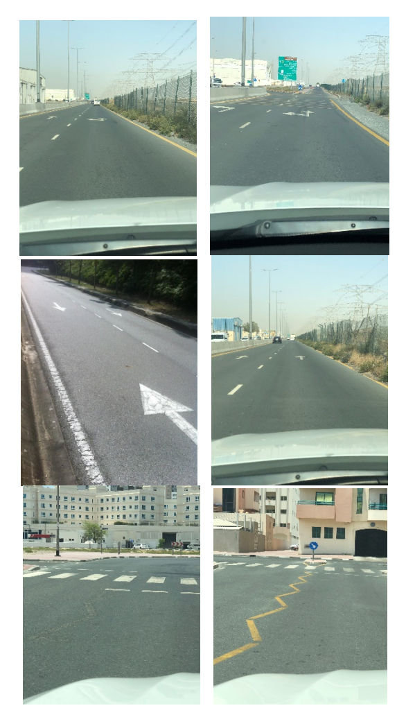
Figure 5. Detection Segments

We tested our algorithm on the dataset described above. Our algorithm uses OpenMP for parallelization in the feature extraction stage. A value of 1.3 was used for the \alpha threshold from (1), while the value for the \beta parameter from Section IV-B was set to 0.01.