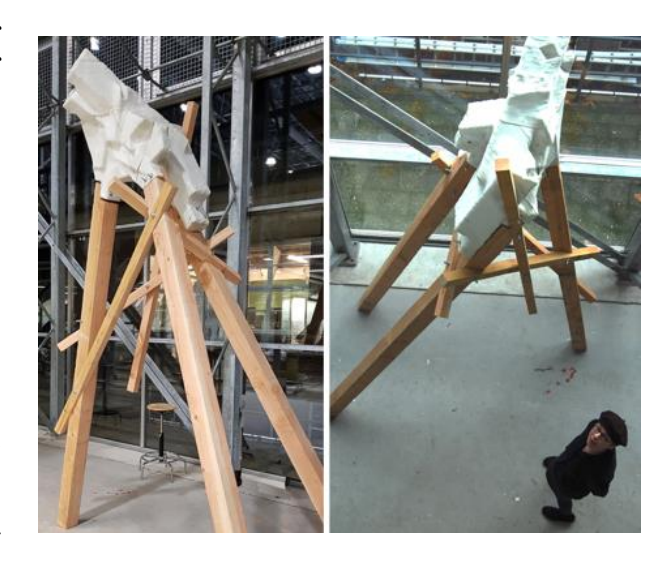
Figure 1. Prototype of the hybrid structure built in laboratory conditions

The developed 1:1 prototype (Figure 1) is a 3.30 m high fragment of a larger structure and consists of variously sized wood elements (linear members and panels) that are milled according to functional, structural, and acoustic requirements and a 3D printed polymer node. The employed D2RP&A approach builds up on knowledge and know-how developed at Robotic Building (RB) Delft University of Technology (DUT) since 2014 [1]. It combines off-site additive and subtractive D2RP with on-site human-robot D2RA (Figure 2) and the challenge has been the integration of various D2RP&A techniques.