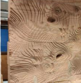
Figure 4. Panels with integrated acoustic and structural performance robotically produced at AUAS