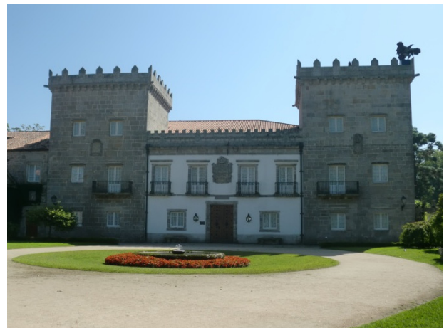
Fig. 1 Quiñones de León country mansion.

The terrestrial laser scanner used was RIEGL LMS-Z390i which conducted the survey on the façade of the Quiñones de León country mansion, which has an area of approximately 30 metres long and 15 metres high. Obtained point clouds are composed of 3D points, given in Cartesian coordinates, along with intensity information. The laser survey was carried out at a distance of 41 meters from the façade, to contain the whole façade in a single point cloud and thus, eliminating the need for more than one location (station). The density of points was 1 inch spacing which gave us a cloud of 5,888,344 points. Below, figures 1 and 2 show the Quiñones de León country mansion and the point cloud with intensity value gained by laser scanner.