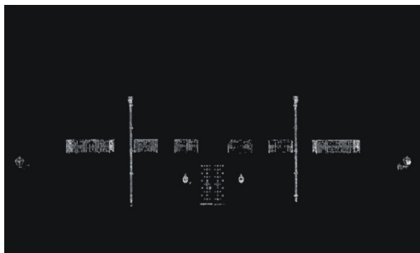
Fig. 7 Façade classified with K-means algorithm and isolated as feature iron.

The operators, "closing" and "opening", if they are applied together, allow the formation of more compact regions, thus eliminating those too small and thin. The results depend on structural elements, which are the responsible matrix for adding or removing objects in images; the effects depend on the shape or size, which are typically defined by the user depending on the application. According to Pu et al.[12], mathematical morphology is used to extract components in images which in turn, are useful in the representation and consequently in the description of region shapes, such as borders and skeletons. More information about the mathematical morphology and its operators can also be found in Serra [13].