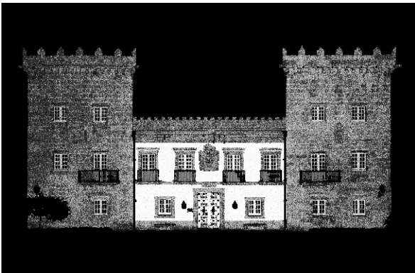
Fig. 3 Result of manual cleaning of point cloud.

Figure 3 illustrates the end result of cleaning performed manually on the point cloud obtained by laser.