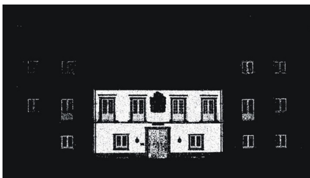
Fig. 6 Façade classified with K-means algorithm and isolated as white wall feature.