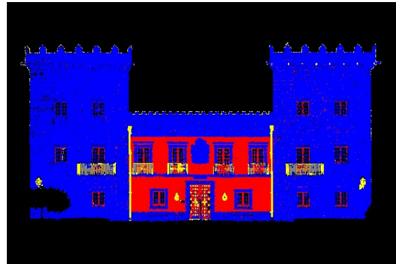
Fig. 4 Façade classified with K-means algorithm (granite in blue, white wall in red and iron in yellow).

the different materials found can be seen, granite in blue, the white wall in red and the iron in yellow.