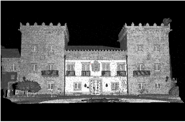
Fig. 2 Point cloud of Quñones de León country mansion acquired by TLS.