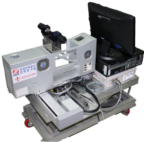
Fig. 2 Aging Inspection System of Box Culvert

following: obtaining 3D image data, lining up and matching the obtained 3D images, measurement based on actual 3D coordinates, and input/output system related to data management and storage. The development of the 3D image data obtaining system can be divided into scanning system development using a laser slit beam and optical 3D scanning system development. The optical scanner of this system is a 3D scanner based on the space encoding method that uses a pattern beam. Its scan range is 400×300mm, degree of precision less than 0.1mm, and scan cycle time less than 1 second (Fig. 2).