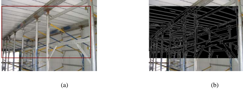
Fig. 4: Example of edge detection. (a) Input video frame showing the ROI. (b) Detected edges inside the ROI