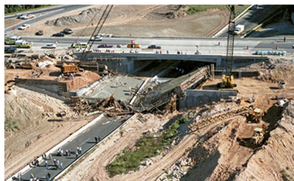
Fig. 1: Collapse of Bridge No. 4 in 1989

individual temporary structures, in this case the tower shoring. It was concluded that construction of shoring and other temporary works were the causes of the collapse. The report evaluated nine possible causes: severe ground vibrations, failure of stay-in-place deck forms, the concrete placement sequence, vehicle damage to shoring, movement of the shoring system from Bridge No. 2 to Bridge No. 4, failure of shoring foundation slabs, the use of hardwood blocking, dynamic loading by the concrete finishing machine, and shoring failure [3].