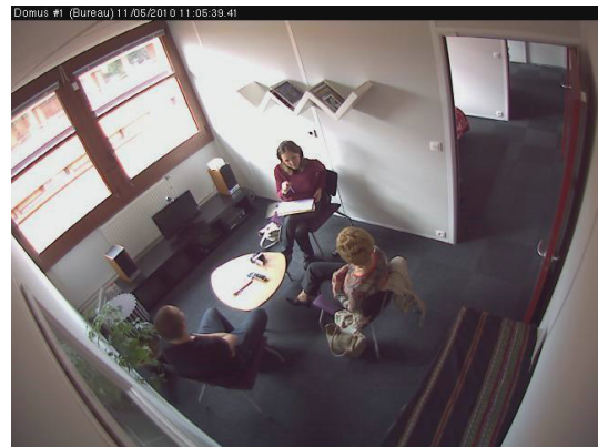
Fig.1. Each test was composed of an interviewer, a wizard and a couple of one elderly person with a relative (except for one senior who was alone) inside the DOMUS smart home of the LIG Laboratory 1

ed to participate in the experiment (2 nurses and one professional elderly assistant).