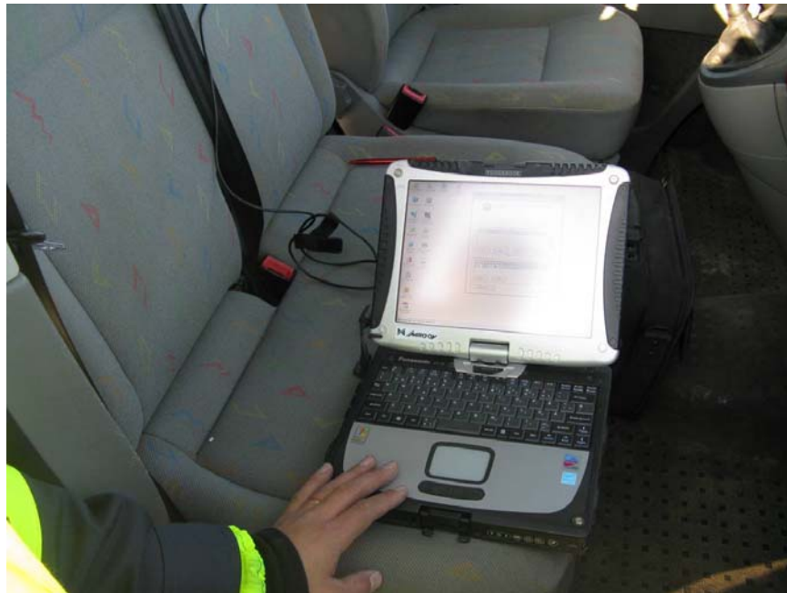
Fig. 5. The laptop runs the user interface & communicates wirelessly with the laser scanner.

A laser scanner and four active targets (prisms) were installed on the system frame (Fig. 4). The frame was found to sufficiently steady and rigid. The system was first calibrated by measuring the prism targets. The laser scanner was controlled remotely by a laptop (Panasonic Toughbook) via TCP/IP using a WLAN connection (Fig. 5). The point clouds were saved into the laptop storage.