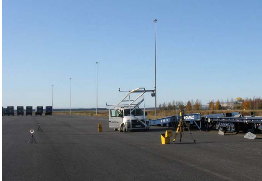
Fig. 6. The orientation of the targets and the total station.

In the initial calibration phase, four targets were set around the vehicle (see Fig. 6). The measurement station of the total station used was 30 meters from the vehicle. The total station was oriented first, then the targets around the vehicle as well as the prisms in the vehicle were measured by the total station.