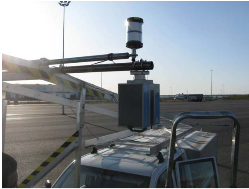
Fig. 4. The installation of the laser scanner and active targets (prism above the laser scanner is one of four active targets).

A laser scanner and four active targets (prisms) were installed on the system frame (Fig. 4). The frame was found to sufficiently steady and rigid. The system was first calibrated by measuring the prism targets. The laser scanner was controlled remotely by a laptop (Panasonic Toughbook) via TCP/IP using a WLAN connection (Fig. 5). The point clouds were saved into the laptop storage.