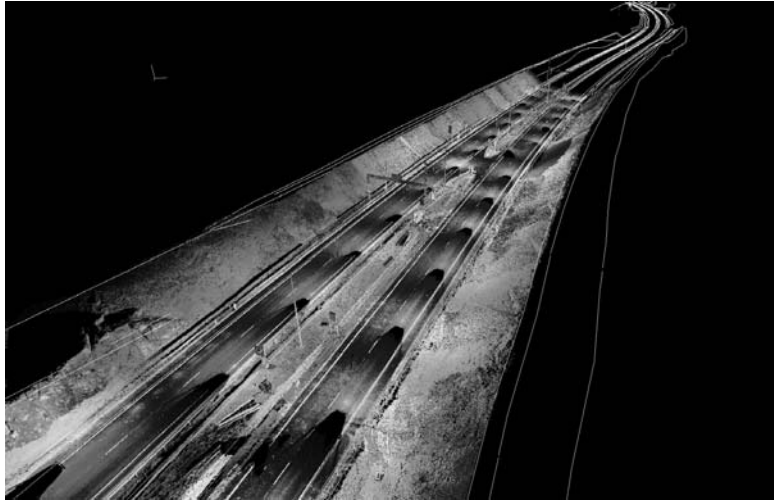
Fig. 2. A 3D point cloud measured using Stop & Go scanning for a Finland highway.