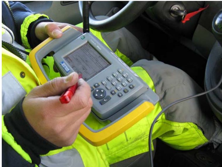
Fig. 7. The reference measurement of the prisms by the total station was guided remotely by a handheld computer.