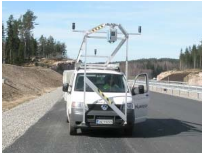
Fig. 1. Stop and Go Scanning laser scanning system developed by Mitta Oy.

A surveying company, Mitta Oy, has developed a new Stop and Go Scanning mobile laser scanning system, which has been used for 3D geometric measurements of road surfaces in Finland. The demand for the accuracy of measurement has been set to \pm 15 mm (relative accuracy demand in z direction) by the owner, the Finnish Road Administration (FRA). This prompted research experiments to determinate the accuracy of measurements by the technique in question, along with an evaluation of whether the accuracy is sufficient relative to the demanded tolerance.