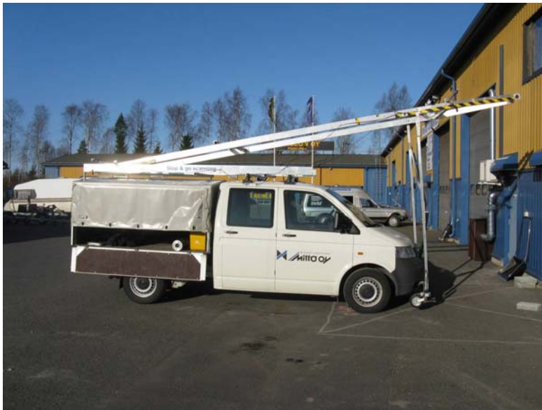
Fig. 3. The Stop & Go mobile laser scanning system developed by Mitta Oy.

The calibration method was developed and performed in collaboration with Mitta Oy in Nuottasaari, Finland, 2009 (Jussila, 2009). Two professional surveyors of Mitta Oy executed the measurements. The University of Oulu planned, followed and documented the experiments.