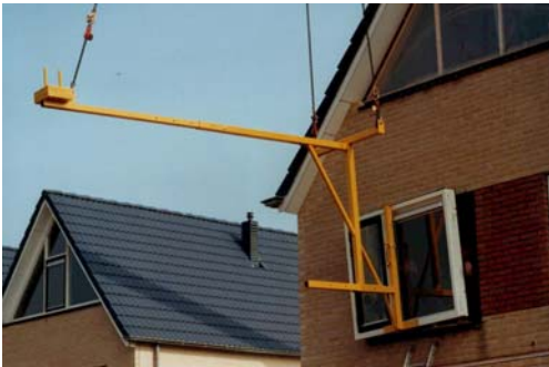
Figure 3. Placing of the Kapla Window Frame

position where the frames are needed. Two persons guide the frame from the inside into the position. Using three specially developed clips, the frame is secured, and using 10 bolts, the frame is fixed in its final position. In this way, about 2 houses per day are served.