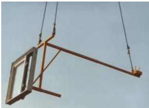
Figure 4. The window frame in the special mechanical device