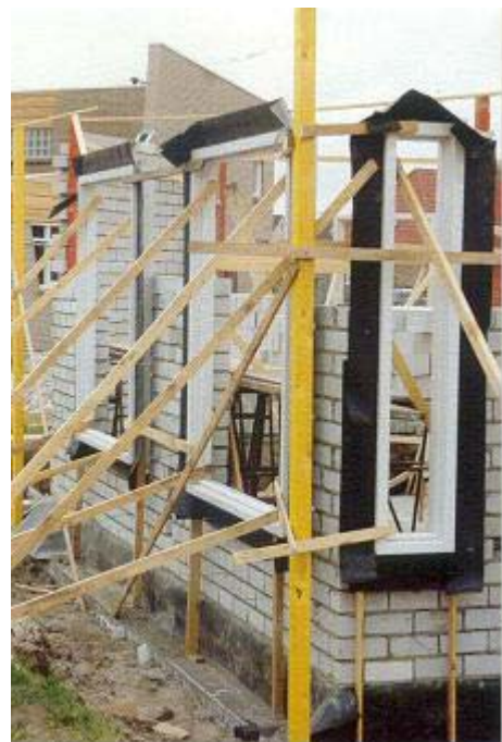
Figure 1. Typical image of Dutch building site; first placing the window frames

In the current Dutch building practice, the window frame has an important function for the brick laying process. The bricklayer uses the window frame to outline the brickwork. This means that the window frame is placed at the early stage of