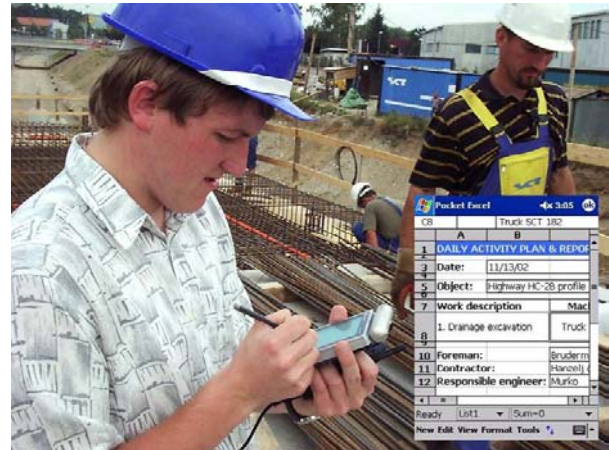
Figure 3. E-site – experimental - educational research project.

construction site itself, can be improved significantly even by using current mobile computing components: unmodified, available PDAs, mobile phones and other existing wireless networks, and web services. This project has been continued in 2002 [Magdic] and in 2003. The results proved the high potential of mobile computing for the construction industry.