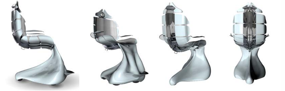
Concept for a mobility robot fusing to a high-performance entity with the user

implementation of new technologies, sensors, actors, assistance devices and robotic subsystems needed in a certain use case normally is a complex, costly and time consuming matter often forcing elderly people to move to a new home, or to set aside the idea of being supported by advanced assistance technology. Since 2008 several seminars on ambient integrated robotics have been held through the br2 lab and in 2010 two funded research projects covering the topic of high-tech assistance will start at the lab. Moreover, European alliances in which br2 has been involved ("Ambient Assisted Living" and JPI "Demografic Change") are further extending their actions and programs.