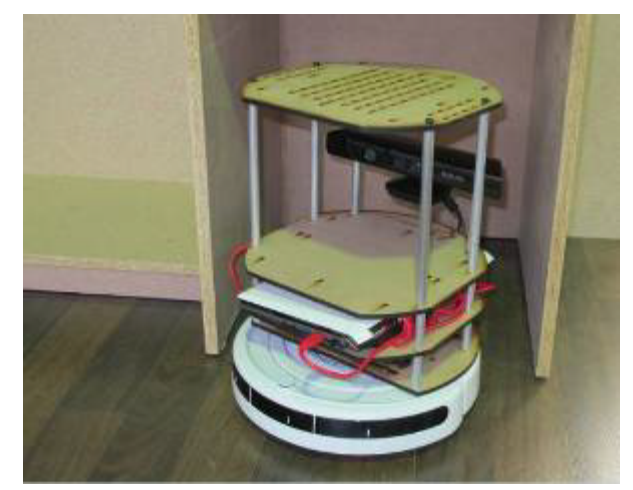
Fig.4. TurtleBot mobile rover

Depth perception allows the autonomous navigation of mobile robots, object recognition and people detection. These implementations aim to integrate an efficient vision system in the home environment, in order to allow systems to be operated by people gestures or movements. Additionally the presence of a person within different areas of an apartment can accordingly trigger the deployment of robotic elements and mechatronic devices, in order to allow an Ambient Intelligence environment realization.