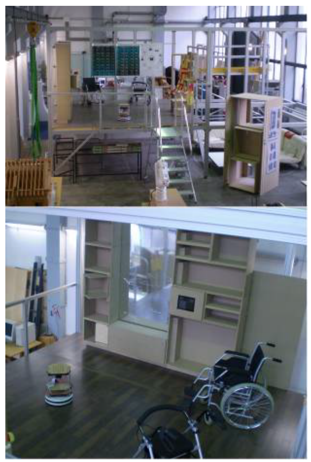
Fig.5. 1:1 scale robotic testing flat

Furthermore, tools like ROS and Gazebo have become more important in light of new building concepts with embedded robotic systems. Over centuries buildings have always been viewed as static structures resistant to changes. However, more recently there have been a different viewpoint about buildings, and they are often viewed as kinetic structures capable of changing its structure or profile to suit the various environmental or user conditions. The concept of kinetic architecture or dynamic buildings is currently being exploited by many architects around the globe. Some projects use these concepts to make the building more sustainable and intelligent while other projects employ these concepts for assistance. We use embedded robotics to build up robotic service environments that are completely integrated in our environment to support activities of daily living. Currently a modular, 1:1 scale robotic testing flat is finalized for experimenting at the author's robotic laboratory, Figure 5. In this environment the aforementioned systems shall be integrated to a total robotic environment.