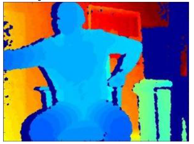
Fig.3. Acquired depth representation

The proposed research deals with implementing depth extraction algorithms using stereo camera arrangements or depth sensors, like the "Microsoft Kinect" Sensor<sup>21</sup>. The acquired depth representation of an individual on a chair within the laboratory environment using Microsoft's Kinect depth sensor is depicted in Figure 3. The depth map was acquired using a Turtlebot<sup>22</sup> mobile rover, which an onboard Microsoft depth sensor. The mobile rover can be seen in Figure 4.