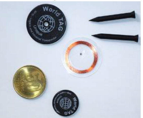
Fig.2. RFID tags

A passive tag consists of three parts: an antenna, a processing unit attached to the antenna, and some form of encapsulation. A tag reader is responsible for powering and communicating with a tag, which is attached either to a personal computer or to a digital communication network. The tag antenna captures energy and transfers the tag's ID. The tag's processing unit is responsible for coordinating the communication and transmission process. The encapsulation maintains the tag integrity and protects the antenna and processing unit from environmental conditions or damage.