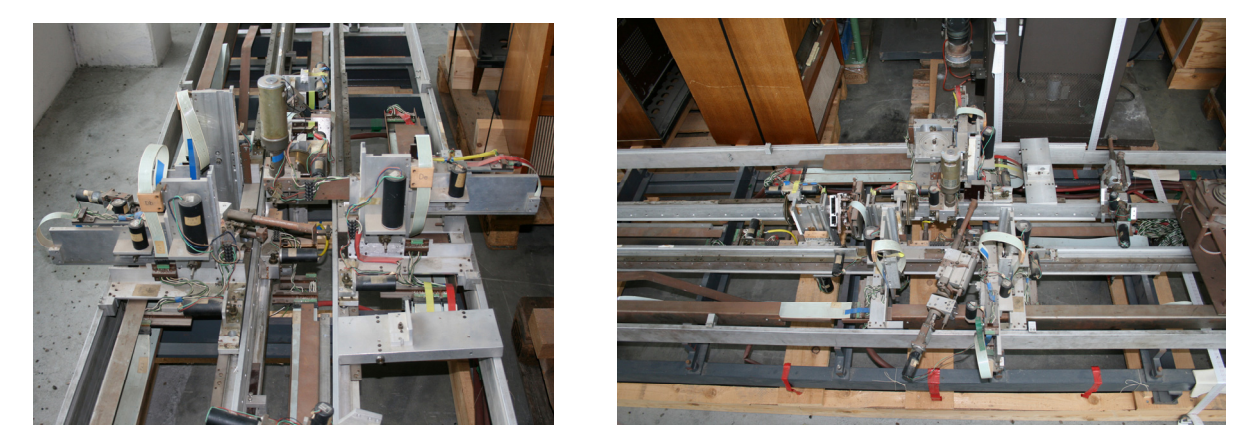
Figure 3, 4: Zuse's Laboratory: Photos Prototype Self-Replication Production System, 2009