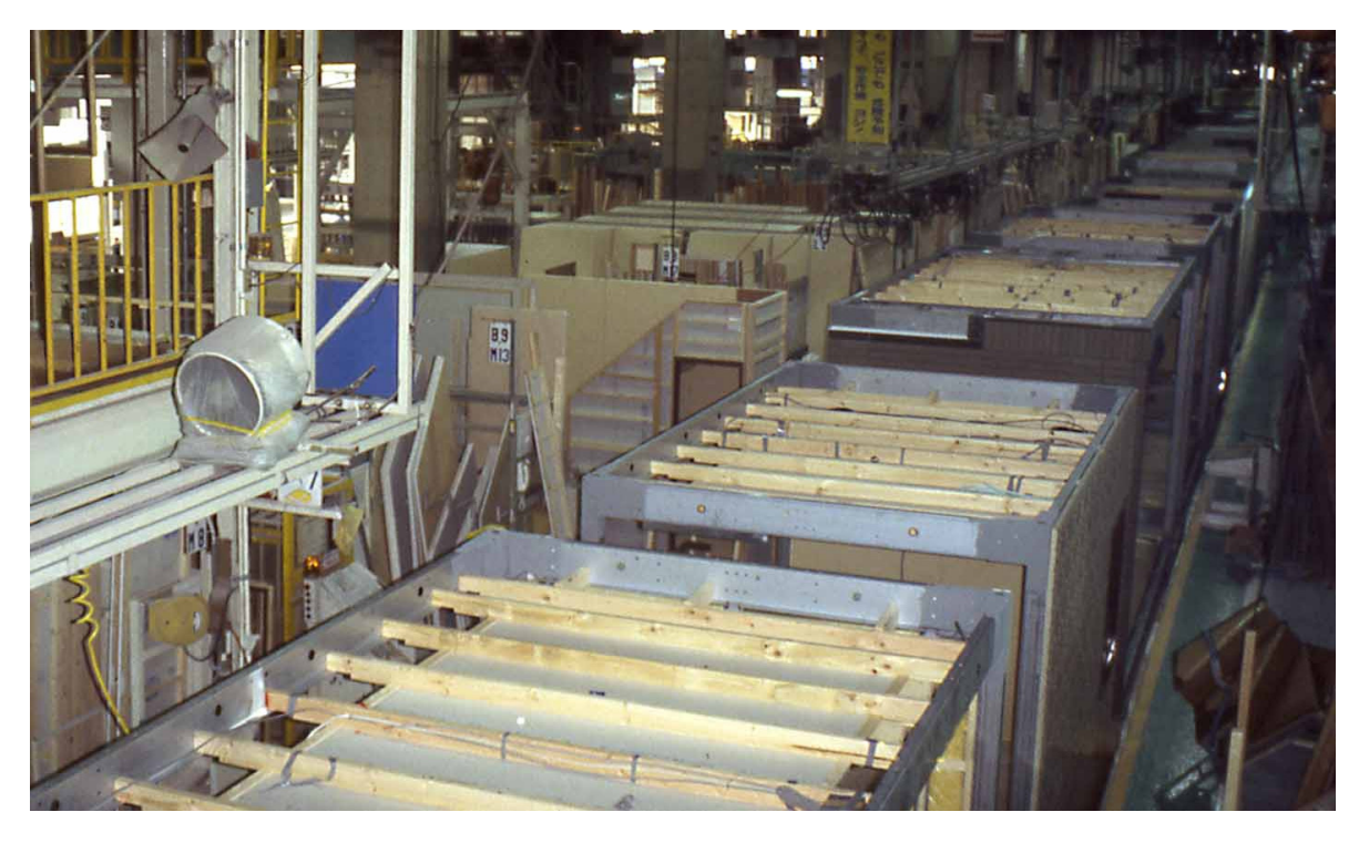
Figure 6: Automated and Continuous Prefabrication of buildings on the production line

changing solution space of more than 300.00 listed parts, about 30.000 parts building up an average sized house have to be chosen correctly and have to be synchronized just-in-time just-in-sequence with the 400 m long assembly line in an optimized way meanwhile a multitude of parallel working processes has to be controlled. HAPPS links the information about customers and individual demands to the process of economic transformation of input resources into output products with a high degree of immediacy and automation.