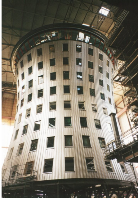
Figure 1 De Bolder under construction in the industrial plant

The project has the following characteristics: diameter: approx. 30 metres; height: 42.5 metres; mass: 25,000 KN; transport distance by water: 25 km; over land: 300 metres; method of transport: self-driven platform trailers and seagoing pontoons; largest obstacle: the Botlekbrug bridge with a maximum headroom of 45.7 metres at lowest possible water level; construction period (superstructure): mid-July 2001 to 29 January 2002.