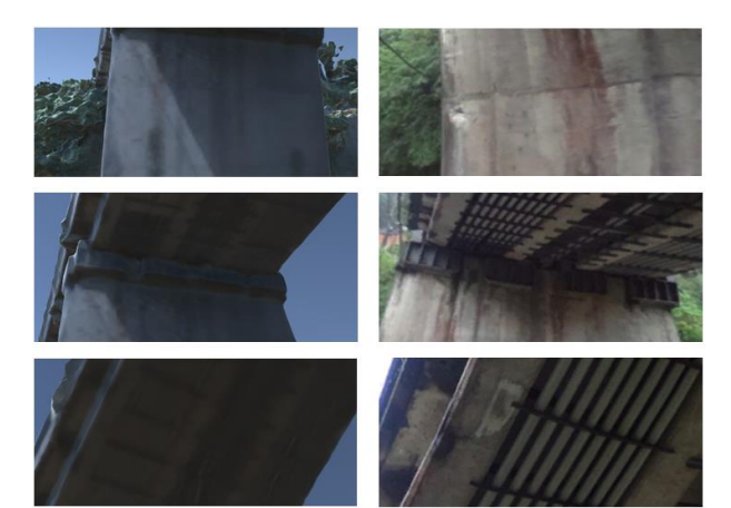
Fig 7. Model-Mode vs Panorama-Mode

The left side, the model, allows more latitude for moving around; and the right side, the panorama, has a better texture to help user understanding reality problems (such as fractures or defects).