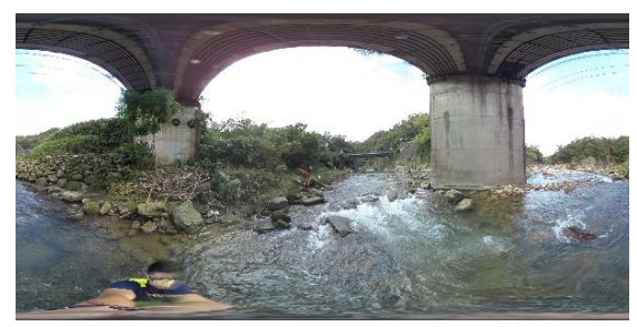
Fig 3. Panorama about Under-bridge

The panorama technology could merge multiple pictures into an "image ball", which allows user to locate on the center and look around, such as Google StreetView or Youtube360. Thanks to the minimization of camera, there are lots of products in the market can take panoramas with a single click (Ricoh Theta S, Kodak sp360, etc.).