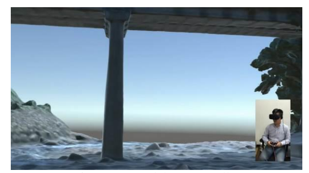
Fig 6. VR Model & Controller

Users could move to the checking point in modelmode, then switch to panorama-mode to verify testing items. Fig 7 is the difference between these two modes.