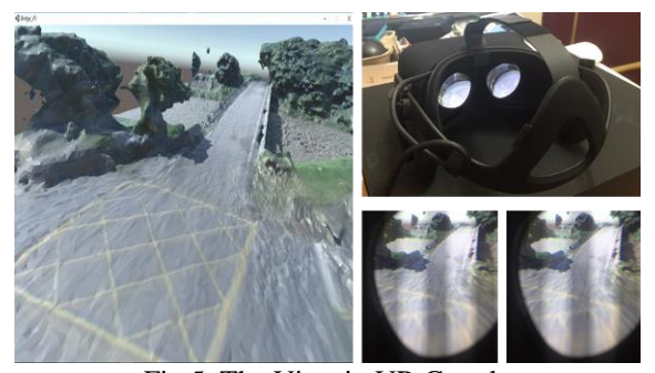
Fig 5. The View in VR Goggle

Fig 6 is showing how user controls the system. As you can see in the lower right, the user moves virtual camera through the model with joystick, and looks around by turning his head.