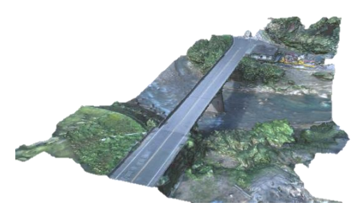
Fig 2. Auto-build-up Model from UAV Pictures

Because our research objects are bridges, there are more adverse factors must be faced when we are trying to get a 3D model from 2D images by software (such as Pix4Dmapper or Agisoft PhotoScan) automatically. For example, the deck is in the same tone, the plants around are in the same tone, the water in the river is moving, the hollow structure is complicated, so and on. Therefore, the 3D model is only able to give a rough outline. It's not detailed enough for safety checking or other operations.