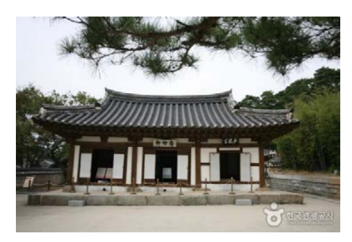
Figure 1 Hanok - Ojukheon House

Hanok is Korea's representative architectural style with more than 2000 years history. It is an eco-friendly building using wood as its main material and using natural materials such as stone and soil [7].