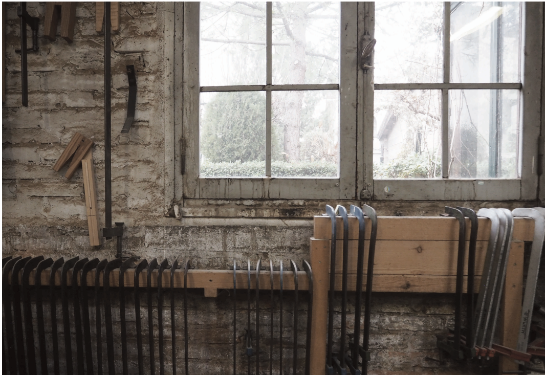
Figure 2. Traditional tools in a Venetian joinery.

As mentioned previously, technological innovation is a process and is not only the result of digital or automated tools: innovation is also conditioned by the social and financial context. Therefore, the geographical location of these manufactories is determinant for their innovation. The investigation became the main tool in discovering the state of the art of manufactories, their variability, and their innovative levels. The analysis was developed in the geographical area of North-East Italy, known as Triveneto, which is composed by three regions: Veneto, Friuli Venezia Giulia, and Trentino Alto Adige. The Triveneto represents one of the most productive areas of Europe and it is characterised by the presences of small and medium businesses with a historical tradition. The parameters for the category were: