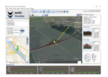
Figure 1. GNSS measurement at the bridge using VRS in Korea

This study sets up a system to select a three-point displacement of the existing bridge. A GNSS goes into the access and acquisition to the target desired. In case of Bangwha Bridge (1000m) in han-river that station is opened in a few years ago, the real-time receiving from the wireless transmission of data is possible for repair of dams and bridges to the related facilities by the fine displacement measurement and analysis process. The obtained GPS data relays information and data transmitted wirelessly about a geospatial information infrastructure irrigation (dams, reservoirs, embankments) the fine-motion and displacement in the 24-hour real-time on those as well most of them will measure the displacement behavior of the corresponding repair facility during a certain period and do not always identified as dangerous situation. In this study, the corresponding facilities receive GNSS satellite signals that can observe the whole region in real time, and