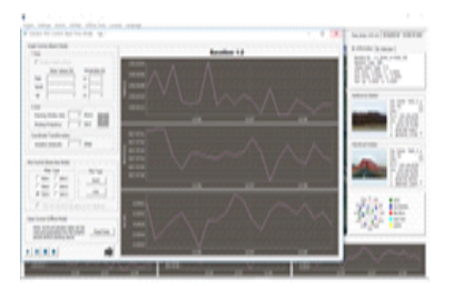
Figure 2. GNSS results after processing

But the GNSS method has a disadvantage in that it can only track the displacement of a precise base line over a long period of time. Therefore, the measuring method with an accelerometer is still preferred. Recently, with the development of smart sensor technology, a small mote is applicable and is able to be installed in a place where environmental factors such as changes of temperature, humidity, vibration, illuminance, fine dust, carbon monoxide, nitrogen and wind intensity etc. are desired. In other words, while tracking the fine positional displacement due to GNSS, it is possible to simultaneously monitor by the USN / IoT sensors collecting the changes of the related values at the same time and analyzing how the constructed facilities can be displaced and collapsed from external natural factors and disasters (Fig.2).