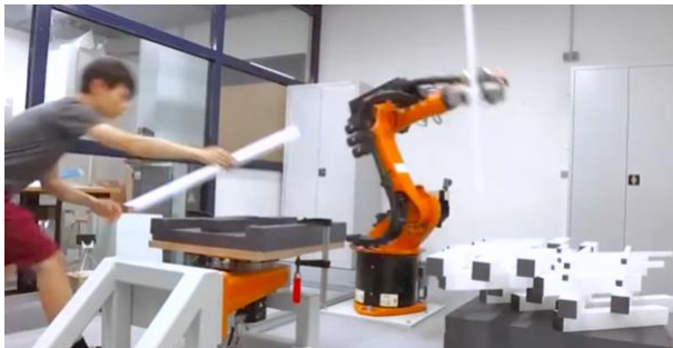
Figure 5. Huma-robot stacking of linear elements tested in lab conditions

The proposed D2RP&A approach is still work in progress, and the proof of concept presented in this paper has been implemented using various mapping, modeling, simulating, and prototyping techniques that identified challenges that need to be tackled.