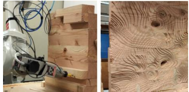
Figure 4. Panels with integrated acoustic and structural performance robotically produced at AUAS

the different wavelengths, when compared to the dimensions of the surface textures. Furthermore, conducting physical measurements is paramount for determining the absorption and scattering coefficients locally, based on local surface details.