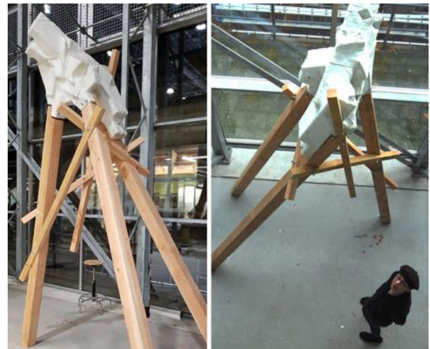
Figure 1. Prototype of the hybrid structure built in laboratory conditions

The developed 1:1 prototype (Figure 1) is a 3.30 m high fragment of a larger structure and consists of variously sized wood elements (linear members and panels) that are milled according to functional, structural, and acoustic requirements and a 3D printed polymer node. The employed D2RP&A approach builds up on knowledge and know-how developed at Robotic Building (RB) Delft University of Technology (DUT) since 2014 [1]. It combines off-site additive and subtractive D2RP with on-site human-robot D2RA (Figure 2) and the challenge has been the integration of various D2RP&A techniques.