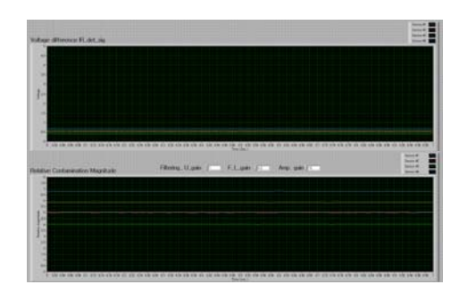
Fig. 4 Relative window contamination measurement results

lighting source was installed on the surface of the outer window to quantitatively evaluate the contamination. Based on the quantity of light that was passing through the window, the contamination was identified.