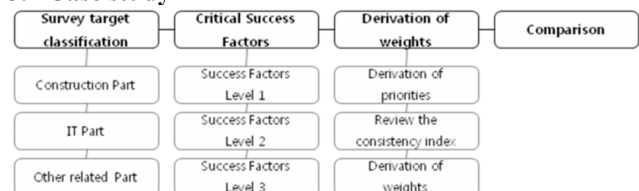
Fig.1 The Method and Process for Study