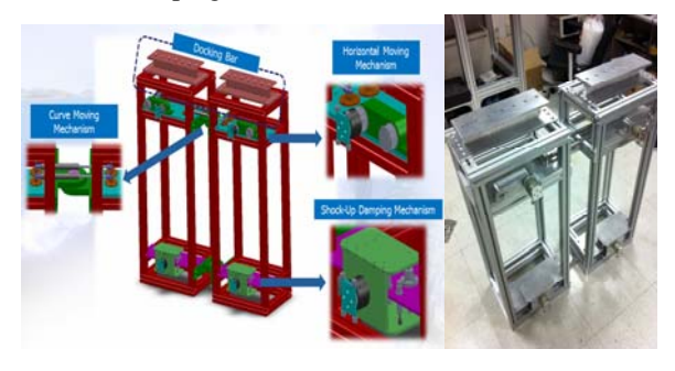
Fig 3. Horizontal Moving System

The lifting system of the BMR includes coupling device for holding and vertically carrying the daughter robot. The daughter robot horizontally moves along the built-in guide rail and perform the maintenance works using tool mechanism. The horizontal moving mechanism is composed of intersection wheels that are designed to be connected to the built-in guide rail for removability and anti-shock damping mechanism.