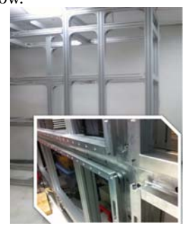
Fig 1. Mock-up Building with Built-in Guide Rail

Important topic of maintenance robot system include safety contact between robot and façades, being able to overcome various obstacles and being able to move efficiently along the façades. We suggest new concept building that installed built-in guide rail. The built-in system that consist of vertical rail and horizontal rail is best suited for providing safety contact to façades on building. That is, through using rails, the system could not contact window directly, and would impose the load on the rail rather than window.