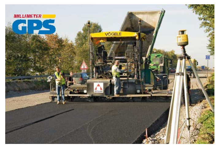
Figure 1: Machine Control and Survey in progress

Processes on a job site resemble an industrial manufacturing process. Different stages depend on each other, but are often carried out independently. Automating a job site by utilizing machine control is a way to increase productivity and reduce the operating costs. To meet the tight time schedule for a project one needs to take care of data management, stake-out and execution. This is where machine control (MC) needs to be factored in to allow its implementation into logistics and processes. If MC systems are to be used this has to be planned, prepared and executed by the persons in charge of the site management. Only if the design data is strictly adhered to each additional planning and design stage, machine control can be executed successfully. An efficient process control based on design data is directly turned into an increase in productivity and dramatically cost savings. Critical factors in job site automation are the efficient implementation of design models and especially the task of integrating survey and stake-out jobs into the on-site processes. This needs a direct link between survey results and machine control as well as continuous exchange of data during the full process.