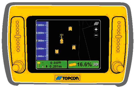
Figure 2: Graphical Display

However, improvement was possible by starting a phase earlier: Why not use a rotating laser while grading the surface itself? For this task, much larger laser receivers, called machine receivers, are used. The simplest application attaches a machine receiver to the blade of a machine, for example a motor grader. Icons or LEDs guide the motor grader operator while he spreads the material: "Blade too high", "Blade too low" or "Blade on grade". This creates a very simple machine control system, called a indicate system. One can build upon this by adding a second receiver to determine the blade slope or by using remote displays that offer a more convenient way for the operator to see the blades level. The capital investment for a simple display system is low, making it an attractive solution even for small construction sites.