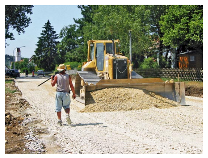
Figure 3: GPS automated dozer

On site, the system works as follows: let's assume that the machine receiver does not pick up the laser beam in the middle of the reception area. Instead, it is received a little lower, say 3 cm. This information is relayed to the control box, where all calculations take place. The control box commands the hydraulics to lower the blade. The blade is lowered and the process repeats. Now the laser receiver might see a deviation of 2.4 cm. Again, the control box commands to lower the blade. This process is repeated until the receiver detects the on-grade position.