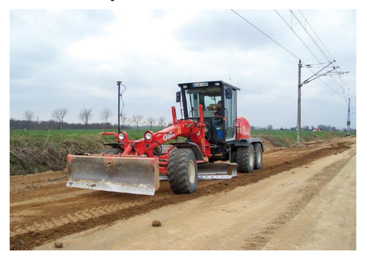
Figure 5: GPS automated Motor Grader

However, some requirements must be met for the system to be able to work properly: First, a digital terrain model (DTM) of the working area is needed. The system software allows importing many different file formats like REB, DWG, DXF, LandXML and ASCII. Creating the DTM directly in the software is possible, too.