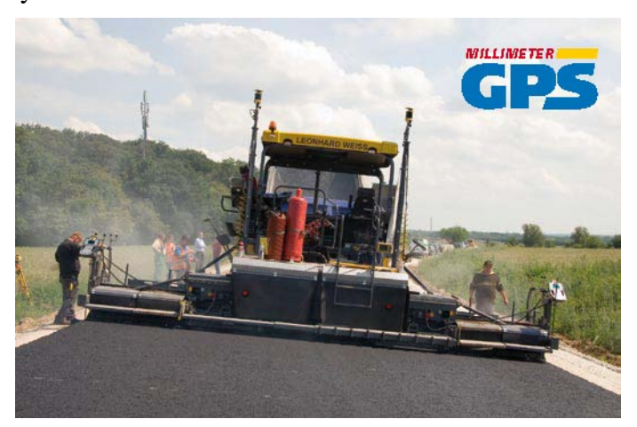
Figure 7: Vögele Paver with Topcon mmGPS

With the first 3D-mmGPS system for pavers TOPCON introduces the latest technology into the final stage of road construction. This real innovation is presented by Joseph Vögele AG: the new 3D control system NAVITRONIC<sup>®</sup> Plus.