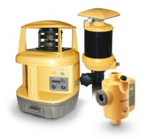
Figure 8: mmGPS components

elevation-check everywhere in your project.