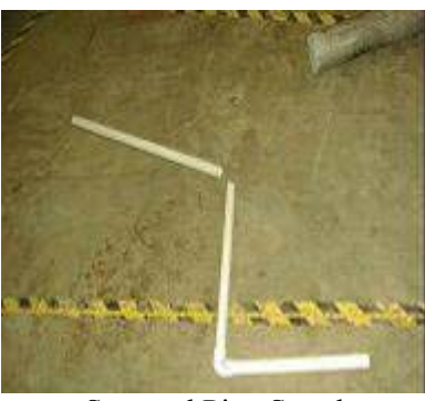
Scanned Pipe Spool

Figure 1: Example justifying the use of merging processes in environment modeling