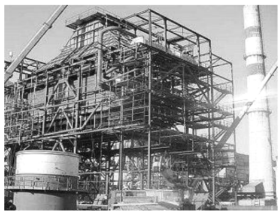
Original Scanned Environment