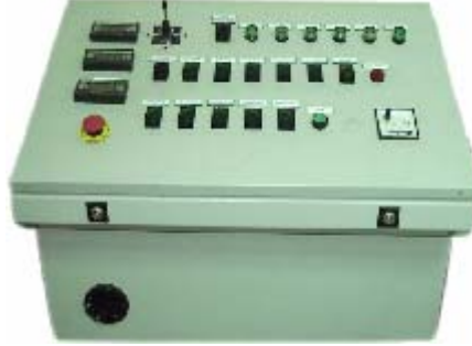
Figure 3. Manual Control Desk.

It is a steel desk that contains the previously mentioned measuring terminals and other electric components to operate the plant. In its surface are installed the digital indicators of weight in each scale, and the push-button that handle each component of the plant. As its name indicates, it allows the operator to run the plant manually, without the need of using the controlling computer . Its use is anticipated only for emergencies, when the controlling computer is out of order (See Fig. 3).