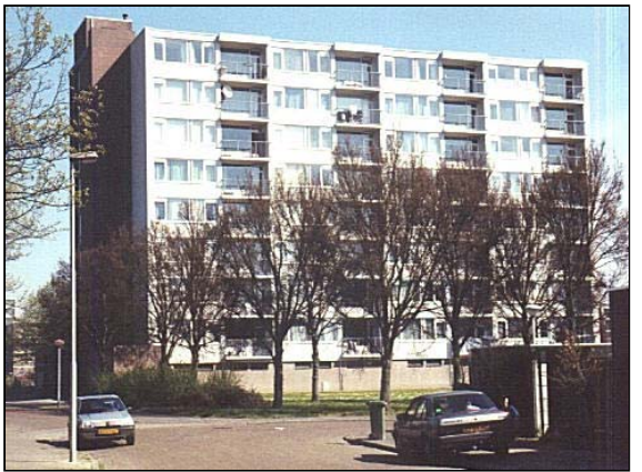
Figure 1. Apartment blocks.

Between 1945 and 1963, about 400,000 apartment buildings were constructed in the Netherlands with the following characteristics: traditional design, the use of clay, no insulation, poor sound insulation. They were, almost without exception, four-storied staircase-access flats. Between 1964 and 1975, another 475,000 medium-rise apartment buildings and 300,000 high-rise apartment buildings were constructed. Today, these apartments still have poor (sound) insulation (see figure 1).