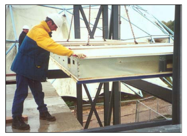
Figure 2. Assembling the floor panels.

• There is no specific roof design. The traditional solution is adopted, i.e. warm roof.