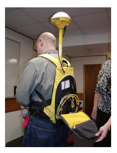
Figure 1. GPS antenna and receiver

Trimble's GPS Pathfinder Power determined its own location at any given time. The GPS reader was a combination of differential GPS (DGPS) receiver and antenna. Position was defined in terms of three coordinates (X, Y, and Z). The backpack mounted device (Figure 1) enabled a real-time sub-meter accuracy using OmniSTAR DGPS correction.