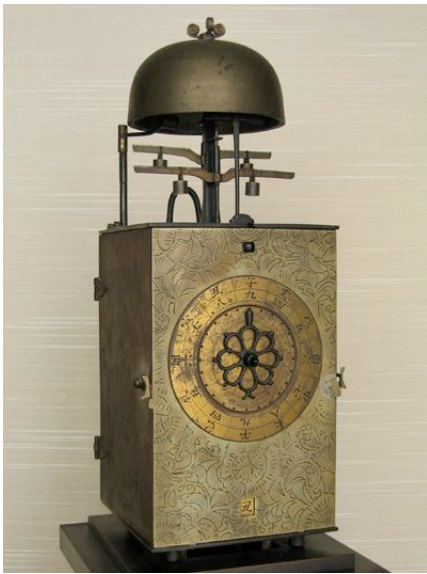
WaDokei exterior view

Although Hisashige was already a successful inventor, his enthusiasm for invention increased and he continued to develop his skills as a clockmaker. Kiko-do advertising from this time showcases what might fairly be described as Hisashige's masterworks — the Man-nen Jimeisho chronometer, Shumisen-gi ; model of the Buddhist universe, and the Unryusui pump. Hisashige also produced many other ingenious mechanical timepieces including the Makura-dokei ; pillow clock, and Taiko-dokei ; drum clock. His skills and ideas as a clockmaker were approaching their apogee, and they would soon all be channeled into construction of the Man-nen Jimeisho , the finest traditional Japanese-style clock ever built.