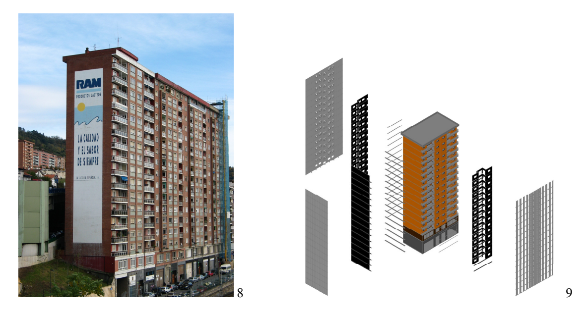
Figure 8: Case study, existing building. Figure 9: Layers of the prefab system which need to be assembled by a robot in site.

The elements should have some looseness in order to get fixed in its proper place. The constantly made measurements would be needed to check if the elements are properly placed or not. If during the placement a mistake would be made, the measurement should detect it and a new restructuration of the elements would be required.