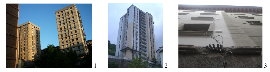
Figure 1: typical apartment building erected during the 1.960 decade. Figure 2: renewal and external insulation of a facade using a crane. Figure 3: final result of a ``external thermal insulation composite systems'' with embedded installations.

There are several universal problems in the European apartments built during the postwar era. First, it's quite common that the insulation of the facades is insufficient. This makes the energy consumption bigger than in the cases of properly insulated facades. Many of those buildings were built with the available services, materials and installations during the postwar period. The owners have added new facilities and services in the façade. Adding services in the facade is not always a satisfactory solution. It is typical to see gas tubes, telecom wires etc on those building facades. Besides, the apartments sometimes lack sufficient space for storage and it is common to double the use of the terrace or balcony as storage space<del>.</del>