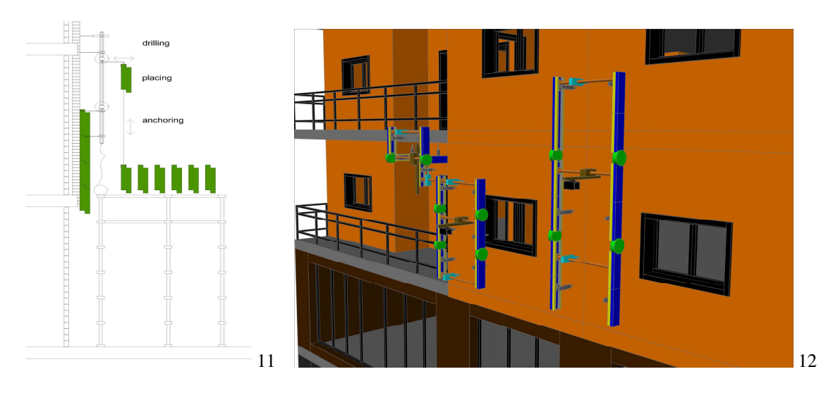
Figure 11: Assembly process scheme. Cross section of the façade. The elements are first stored on the underground platform. Then, they are uploaded and anchored to the existing façade.Figure 12: The robot's performance view. It could be possible for the robot to fold in order to adjust to balconies.Images by Kepa Iturralde

The facade elements have been pre-designed with the proportional accuracy the robot is capable to offer, which means that the joints have vital importance. But if we design elements with wide joints, the insulation will have some gaps and the interior heat will find some leaks to reach outside. So the facade elements have to be designed with considerable flaps. Therefore, it may be difficult to obtain totally straight lines and planes. But that could be solved with constant measurement.