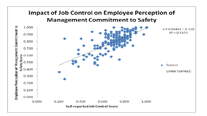
Figure 1 - Impact of JC on workers' perception of management commitment

Correlation and regression analysis were used to determine whether a relationship exists between the perceptions of JC and MC. Figure 1 shows a scattergram of JC scores and corresponding reported MC scores. Coefficient of determination denotes the strength of the linear association between two factors, which were JC scores and MC scores in this study. Its value can range from 0 and 1 and as the value approaches 1, the greater the statistical significance. In this study, the coefficient of determination value was 0.5471, which indicated a moderate to strong positive correlation. This value can also be interpreted as about 55% of the total variation in MC scores can be explained by the linear relationship between JC scores and MC scores. This relationship can also be observed in the scattergram in Figure 1. It is concluded that there is a moderate to strong positive correlation between a workers' self-reported job control and his/her perception toward management's commitment to safety.